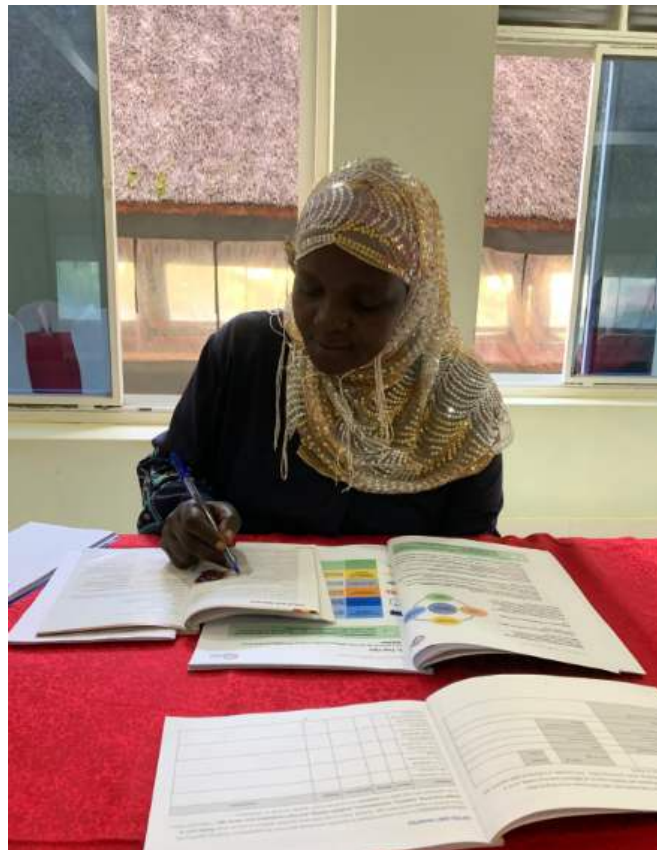
Figure 3: A teacher using the toolkit during a workshop

Contextual Alignment: Alignment with existing tools and processes in Uganda, such as terminology, referral mechanisms and safeguarding protocols is paramount. The toolkit is meticulously designed to complement the national learning needs identification tool and accompanying resource guide. Collaborative efforts with Crane Viva and Cheshire Services Unit (CSU) have ensured integration with these resources, supporting the sustainability of the toolkit and serving the overarching goal of enhancing educational support for learners with additional needs.