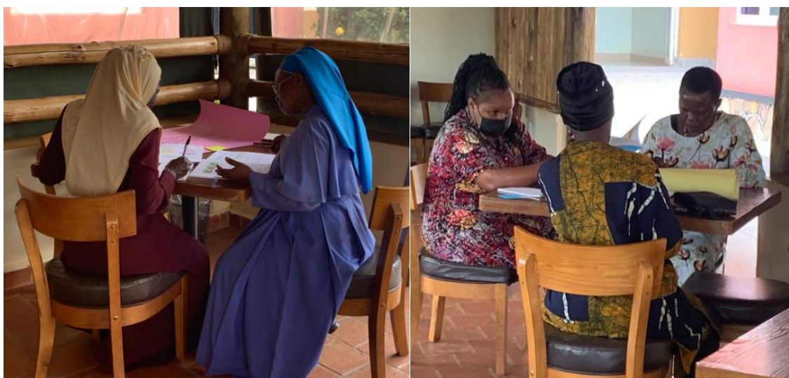
Image 5 & 6: Teachers participating in peer-to-peer activities during a workshop on lesson planning