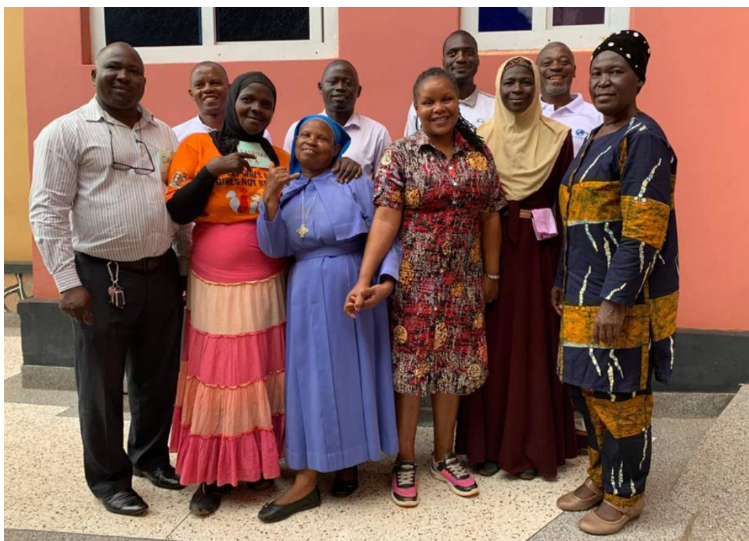
Figure 2: During pilot 1 workshop - headteachers, teachers and project team members

Throughout all four phases, we centred inclusion and equity at the heart of the work. For example, we ensured that we utilised inclusive practices at the workshops and built positive and meaningful relationships with the teachers involved in the project.