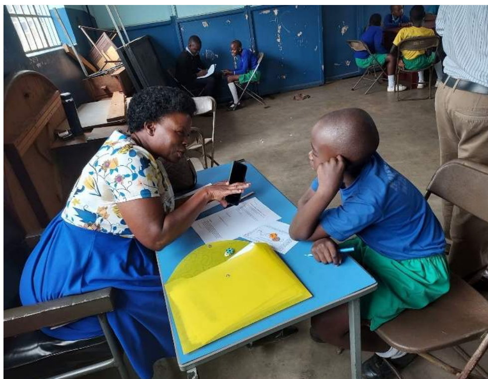
Figure 4: At a Primary School, an enumerator administers one of the non-academic instruments with a student