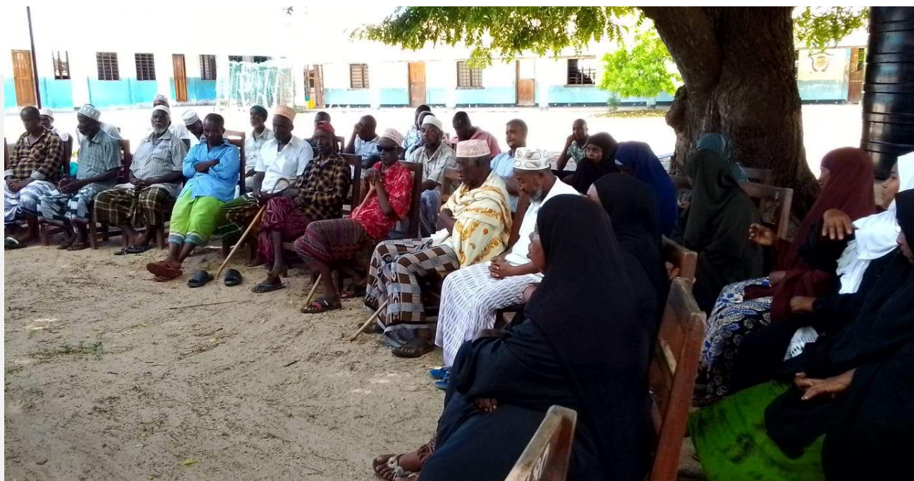
Kiunga community participating in a public meeting

Kiunga Youth for Peace and Development is a community organisation based in Kiunga, Lamu County, Kenya. Kiunga is a coastal community bordering Somalia to the north and the Indian Ocean to the east, where fishing and small-scale farming are the main sources of livelihood. The community faces significant educational challenges, including low academic achievement, a cultural preference for educating boys over girls, and high rates of school absenteeism and dropouts – particularly among girls, many of whom do not advance beyond primary school due to early marriages. These issues contribute to a growing number of idle and unemployed youth, some of whom are vulnerable to recruitment by militant groups. Insecurity has further exacerbated the lack of job opportunities and disrupted access to education. The organization’s key priorities are to promote inclusive access to quality education—especially for girls—create employment opportunities for youth and enhance community safety and stability.