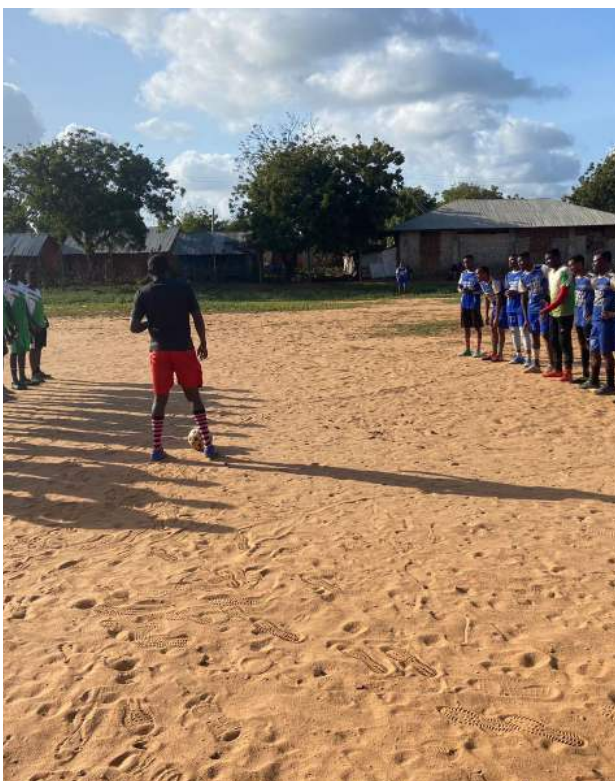
Security Personnel Giving life lesson to Youth